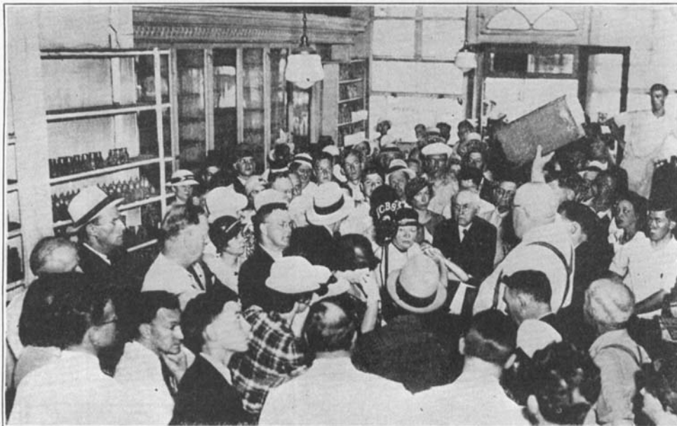
Auction Sale of Leadbeater Pharmacy for AMERICAN PHARMACEUTICAL ASSOCIATION. The sale took place in a room next to the old pharmacy on July 19, 1933.